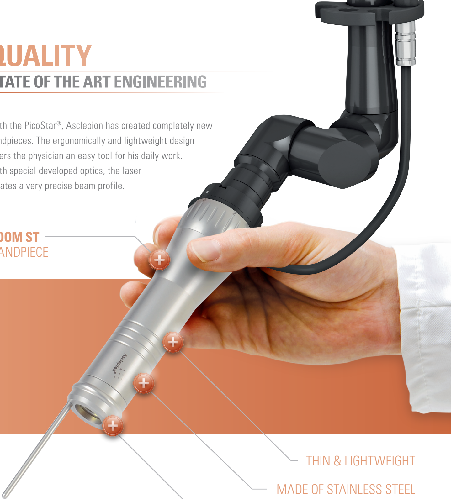
ZOOM ST HANDPIECE

With the PicoStar®, Asclepion has created completely new handpieces. The ergonomically and lightweight design offers the physician an easy tool for his daily work. With special developed optics, the laser creates a very precise beam profile.